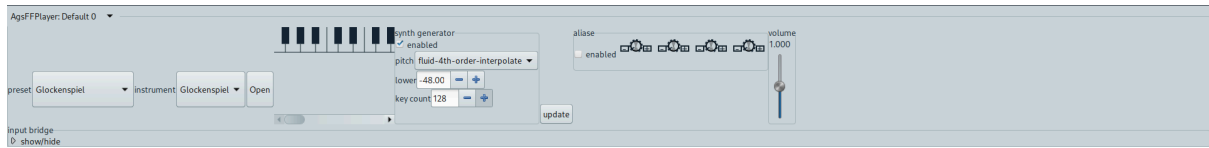
The ffplayer screenshot

Produce audio data by opening Soundfont2 audio file container format. There three available controls, preset and instrument to navigate within container format and a open button to read Soundfont2 files and assign the selected instrument to the input.